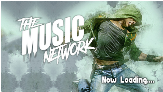
splash_hd - 1280 x 720

Here's an example of a Roku channel's png. artwork. * Notice, artwork is not just a logo. It should also have a creative background.