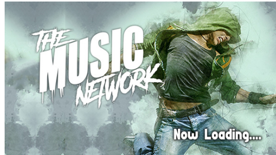
splash - 1920 x 1080