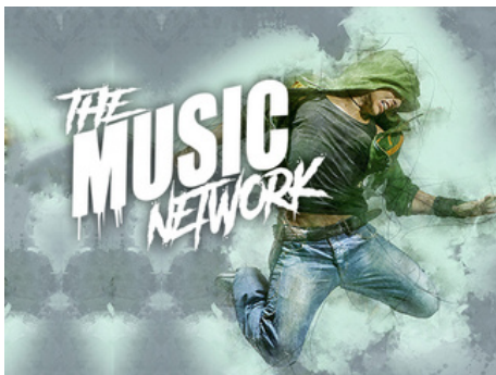
Logo Icon | Store - 540 x 405