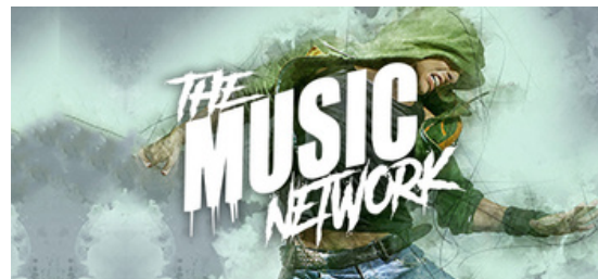
Top Logo - 698 x 323